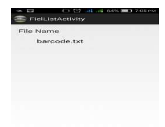
Figure 4: Retrived File based on send query

Firstly, it take a picture or capture the image through mobile which should be a text image. After that it goes into the choose mode onto the mobile. Here there has an option to take as an input wheather it is captured image or from stored image of the dataset. Hence, the choose mode will help to select the mode of the input image easily.