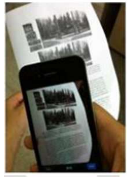
Figure 3: Capturing the image by mobile device

In the proposed research plan of work shows that the visual query is captured by the user and sent to the server end, where the visually similar documents are matched and returned. Many of the search engines deployed on the web retrieve images without analysing content present in the image; they match user queries against collocated textual information.