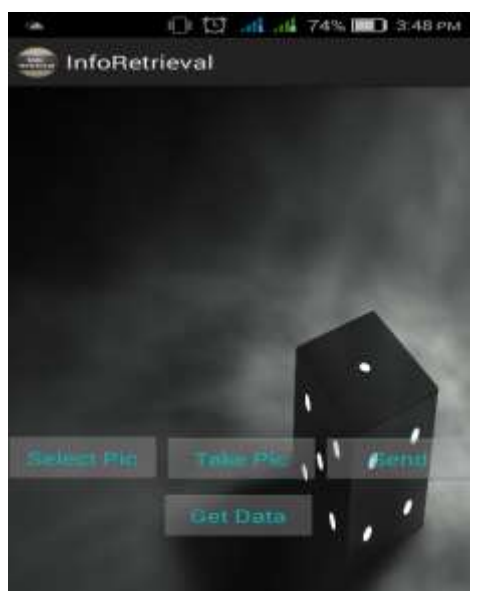
Figure2 Graphical User Interface

In the above image shown the graphical user interface which Information Retrieval Apk(application) for according to the so far idea. This Apk is comes under the user side that is in user's mobile. Where user can easily access the front view for sending the query to the server. The image is formulated as query and send it to server, where the two options for the user one capture the image and sending to the server and second one is select the image from the dataset for formulated the query to send the server.